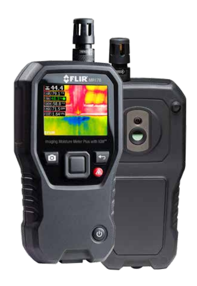
IGM technology guides you where to measure