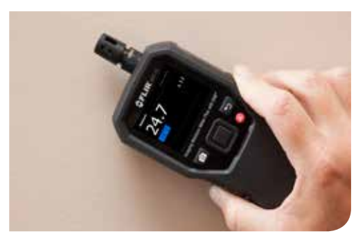
Verify moisture with Pinless measurements