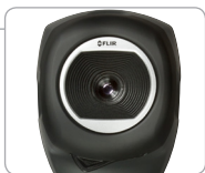
Focus-free Lens for Point-and-Shoot Simplicity