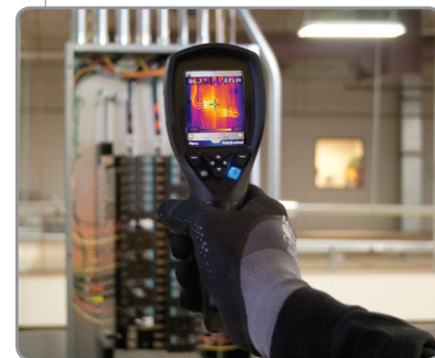
Find Hot Spots Fast!