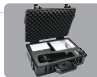
Includes Hard Case