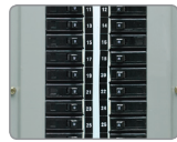
Human Eye View