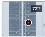
IR Thermometer Single Spot