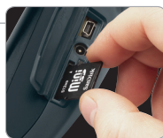
Removable SD Card and USB Output for Fast Image Downloads