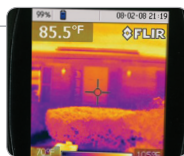
Excellent 2.8" Color LCD Shows the Whole Scene