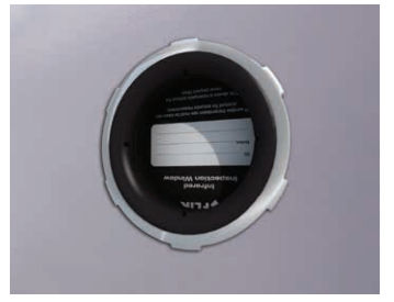
Single PIRma-Lock™ ring nut.