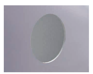
One hole to cut.