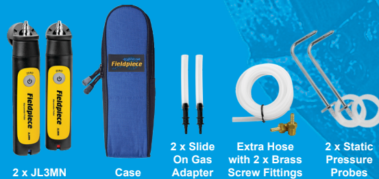
2 x JL3MN

Screw the brass adapter directly into the gas regulator taps.