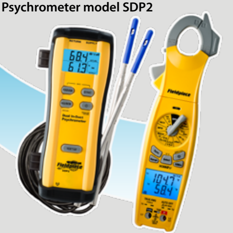
Wireless Clamp Meter model SC660