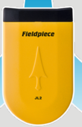
Wireless Transmitter model JL2