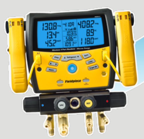
Wireless Digital Manifolds models SMAN4, SMAN440, SMAN460