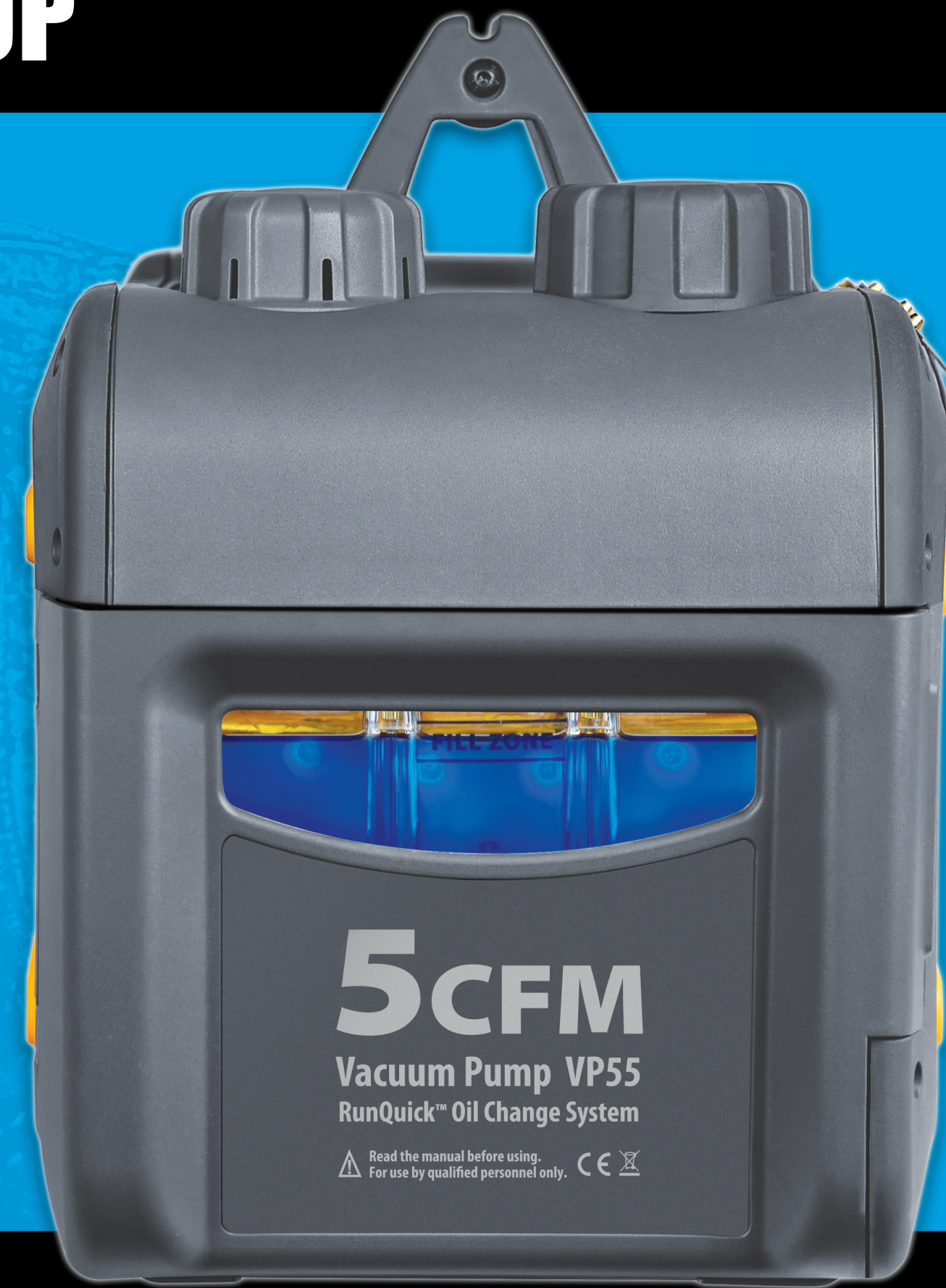
Blue LED backlight for optimal oil viewing

Read and understand operator's manual before use. CAUTION