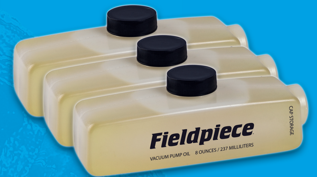
Part # OIL8X3 Fieldpiece Vacuum Pump Oil 3 Pack 8 Ounces (237 Milliliters)