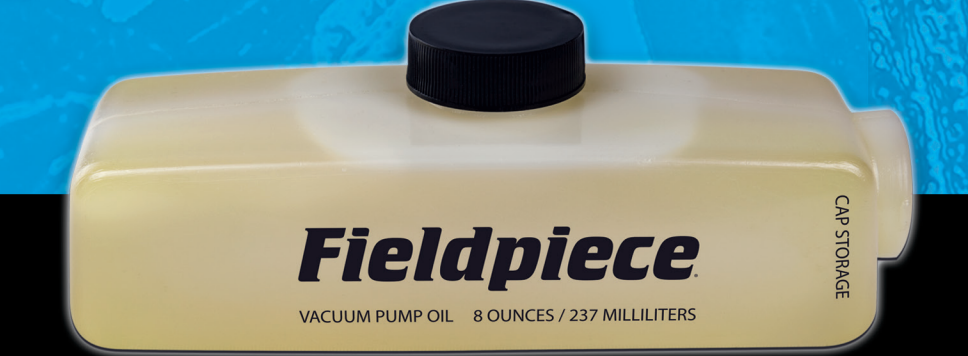
VP55 Includes (2) Filled Oil Bottles