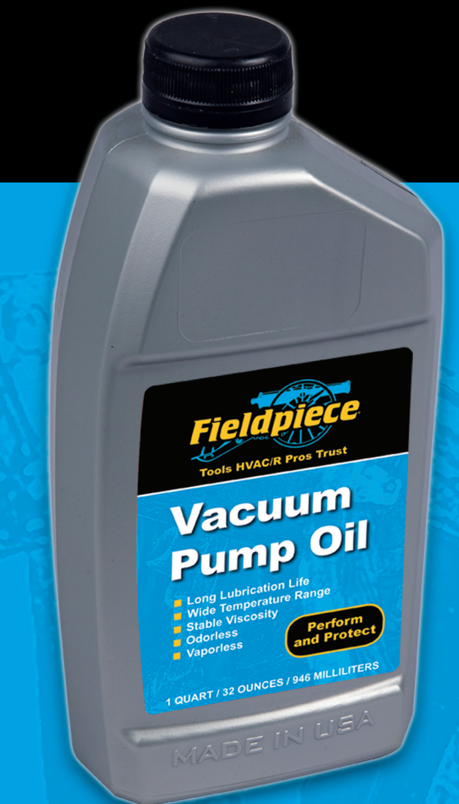
Part # OIL32 Fieldpiece Vacuum Pump Oil 32 Ounces (1 Quart / 946 Milliliters)