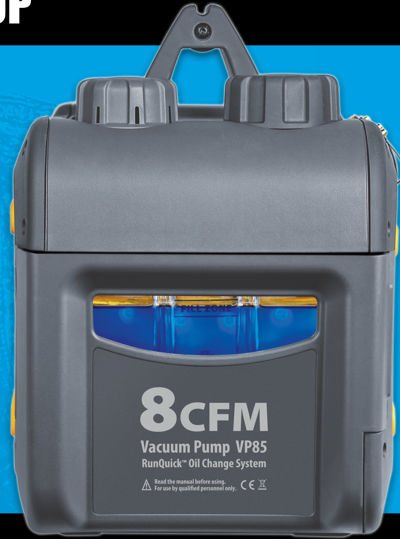
Blue LED backlight for optimal oil viewing