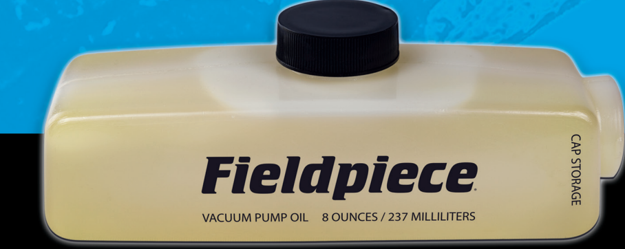
VP85 Includes (2) Filled Oil Bottles