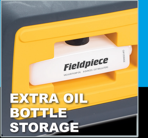
EXTRA OIL BOTTLE STORAGE

Part # OIL8X3 Fieldpiece Vacuum Pump Oil 3 Pack 8 Ounces (237 Milliliters)