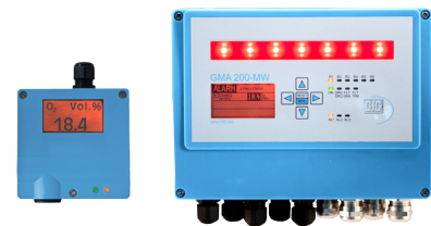
EC 22 Transmitter and GMA 200-MW4 Controller

The embedded software of the EC 22 linearizes the measuring signal and compensates for the effects of temperature. As a result, correct readings are transmitted even with weather related fluctuations in temperature. In addition, the transmitter also offers the option of transmitting service, maintenance, and error messages to a connected gas measuring computer.