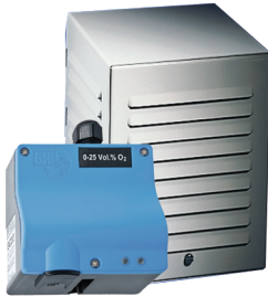
CC 22 with weather protection

A weatherproof housing not only protects transmitters against exposure to wind and weather, but also against contamination and excessive temperatures caused by direct sunlight.