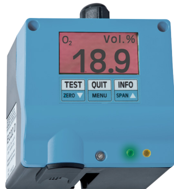
Graphical display with control buttons and horn