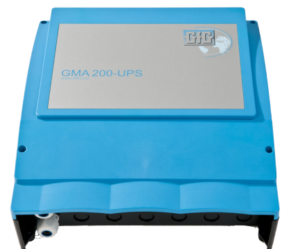
Redundant power supply in IP-65 wall-mounted housing: GMA 200-UPS