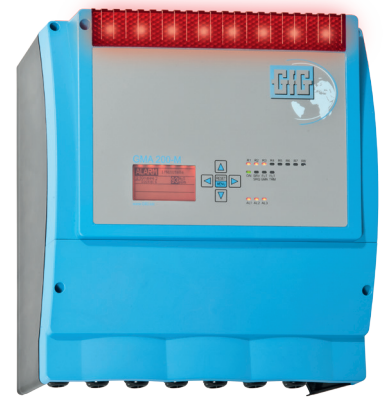
GMA 200-MW in IP-65 wall-mounted housing