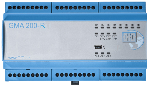
GMA 200-RT *