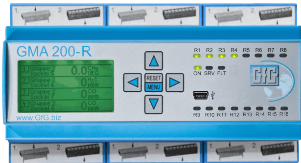
GMA 200-RTD **