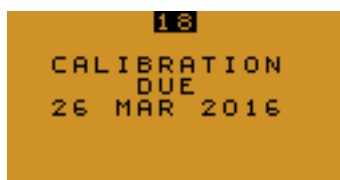
Configurable calibration options