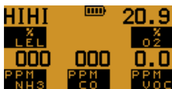
Display in alarm conditions