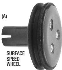
SURFACE SPEED WHEEL