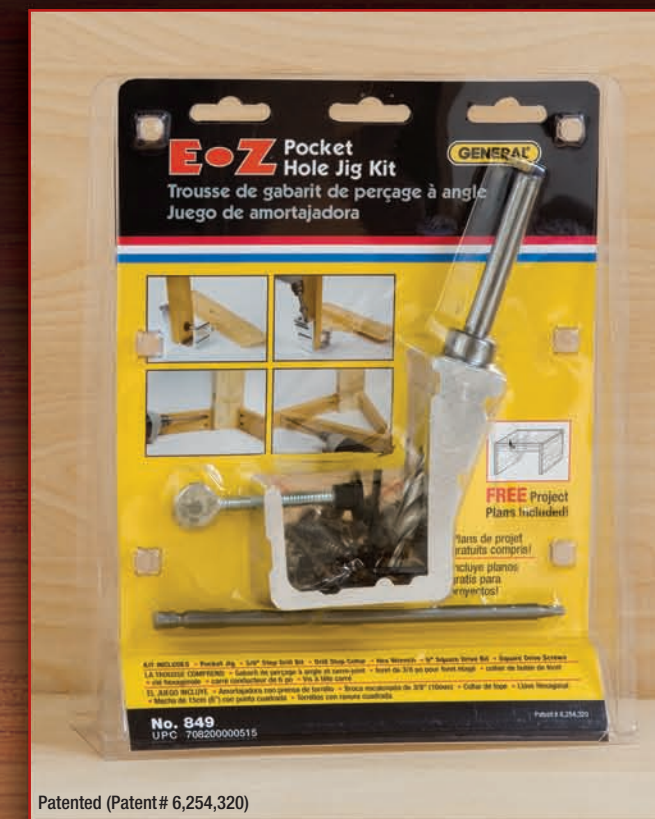
Patented (Patent# 6,254,320)