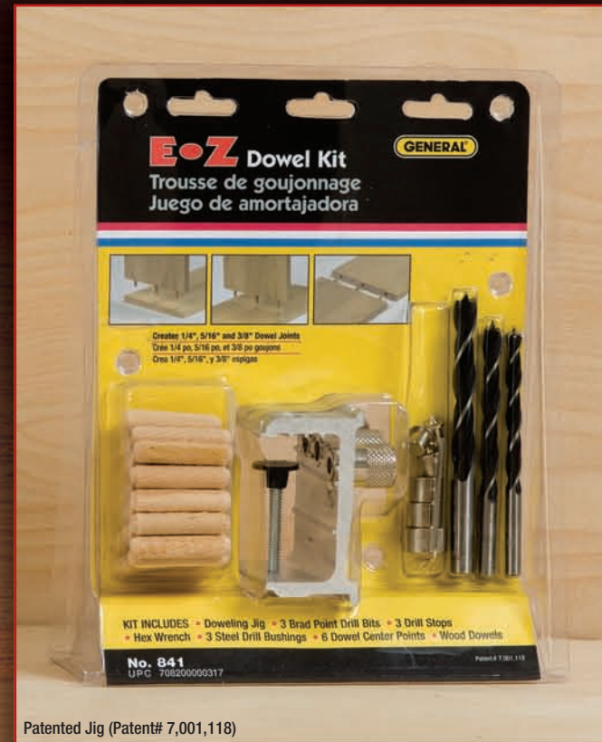
Patented Jig (Patent# 7,001,118)