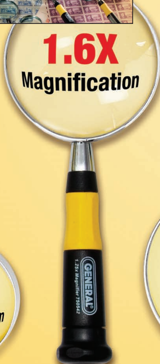
NO. 750542 3" (75mm) Magnifier