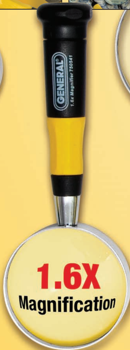
NO. 750541 2-1/2" (65mm) Magnifier