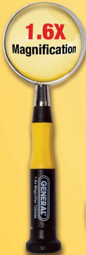
NO. 700540 2" (50mm) Magnifier