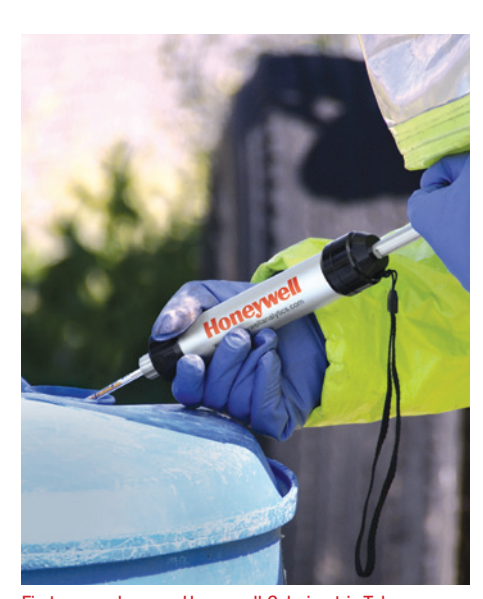
First responder uses Honeywell Colorimetric Tubes and Hand Pump to measure VOC levels inside a barrel.