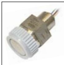
High temperature sensor for combustible gases