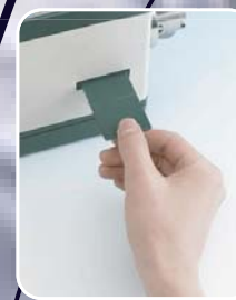
Easy sensor cleaning