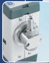
Impactors for 10 and 4 micron cut off