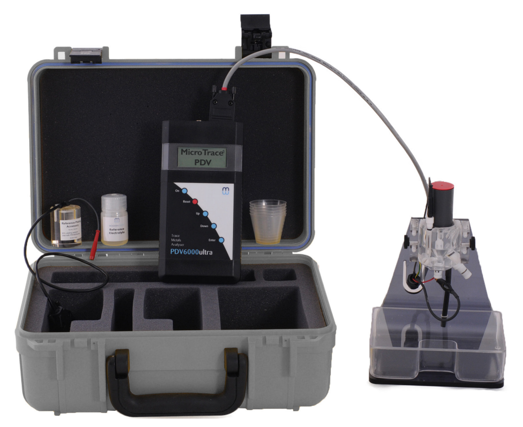
MicroTrace PDV Series with Labcell Option (VAS Only)

The MicroTrace PDV has been upgraded to allow much improved stand-alone operation by utilizing a new tablet computer app now included with the PDV. The USB connector replaces the serial port. The upgraded product can be run either on 4 \times 1.5 \text{V} AA batteries, or from the mains using the standard 8 - 12 V DC transformer: