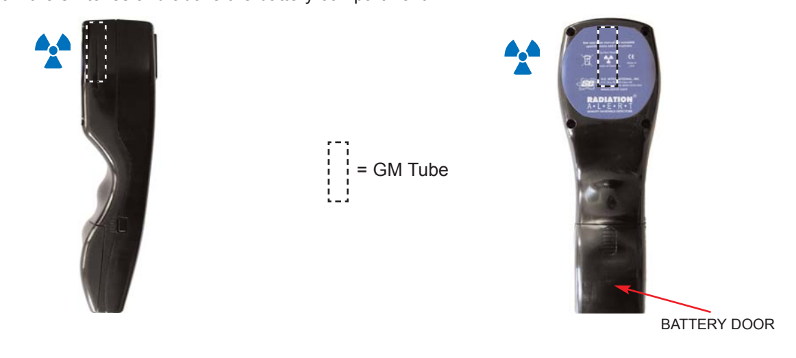
Illustration 2 MONITOR 4, 4EC, MC1K