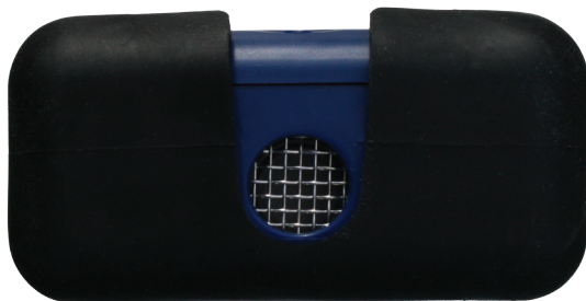
Ruggedized boot and Stand Included