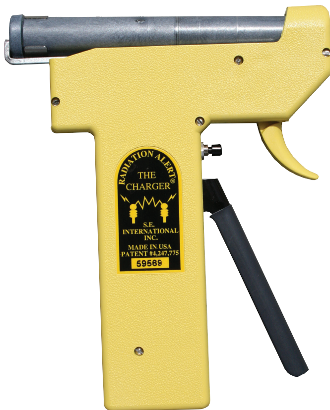
The Radiation Alert ® Dosimeter Charger (Shown Above) can recharge Pen Dosimeters without batteries