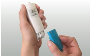
Easy exchange of probes with testo 206-pH1/-pH2/-pH3