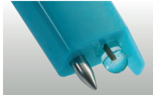
testo 206-pH1: pH1 probe head for liquids