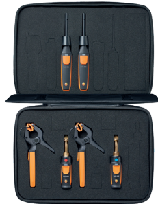
AC/R Test & Load Kit: 0563 0009