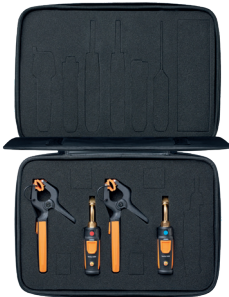
AC & Refrigeration Kit: 0563 0002 20