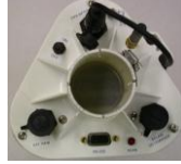
Figure 3: The power switch and Scan/Receive light is located on the bottom of the WeatherHawk station.