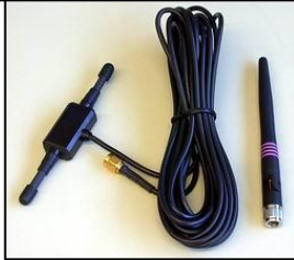
Figure 5: RF4xx antenna connector

Figure 4: The WeatherHawk antenna may be a flat surface mount antenna (left), or a whip antenna (right) that connects directly to the radio, or a tri-band surface mount antenna (not shown).