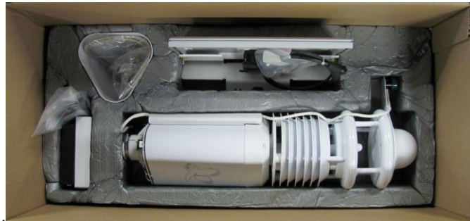
Figure 1 Model 620 with solar panel