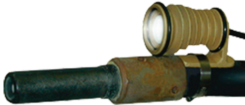
3600 Halogen No-Air Aluminum Blast Light