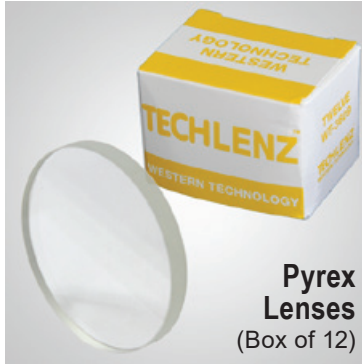
Pyrex Lenses (Box of 12)