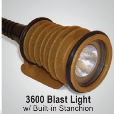
3600 Blast Light w/ Built-in Stanchion