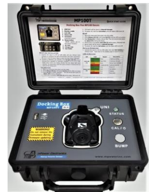
UNI Docking Box