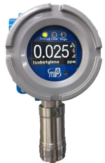
Reverse Display in low light