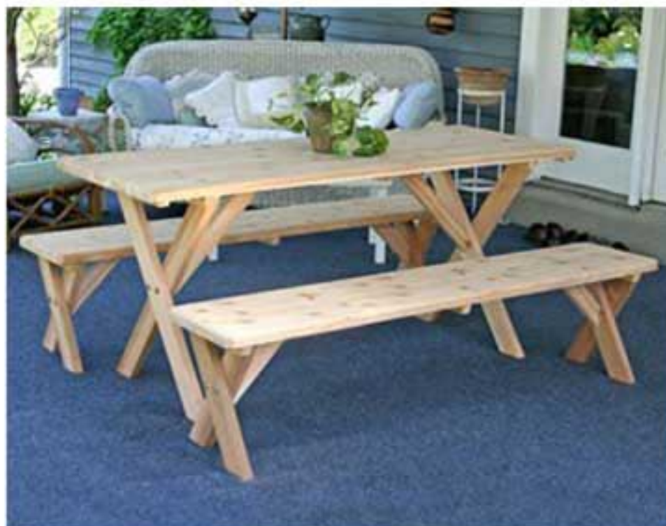
5 Foot Table Shown Above