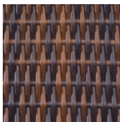
SABLE RESIN WICKER B