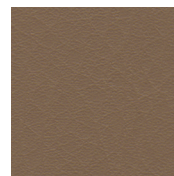
TRUFFLE NAUTICAU TF