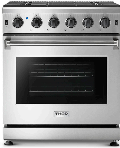
Product: 30 Inch Gas Range in Stainless Steel Model Number: LRG3001U / LRG3001ULP