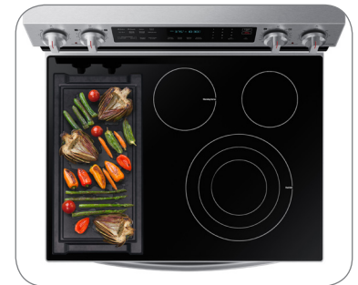
Removable Non-Stick Griddle