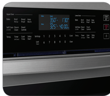
Digital Touch Controls

Fingerprint Resistant Black Stainless Steel