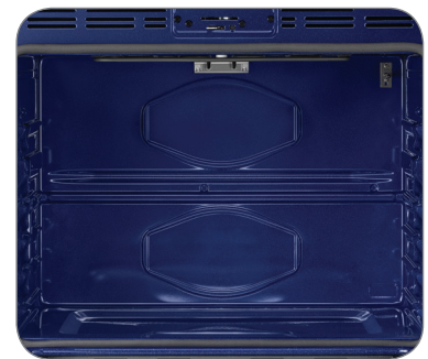
Blue Ceramic Interior