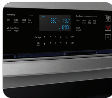
Digital Touch Controls

Fingerprint Resistant Black Stainless Steel