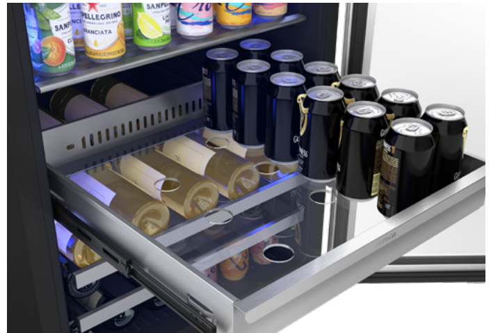
Stainless Steel Rollout Bin with Transparent-Gray Glass