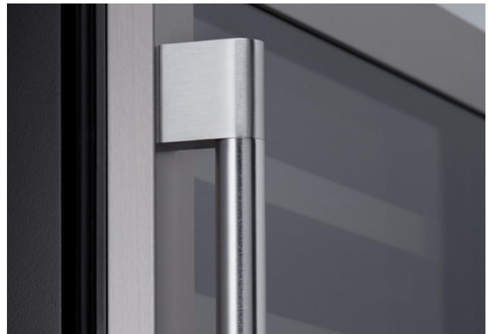
Optional Pro Handle