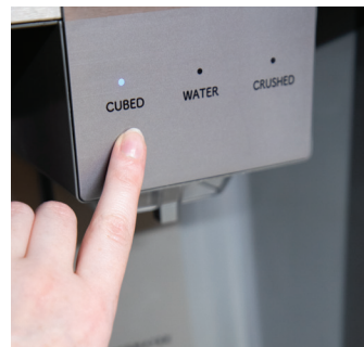
The automatic ice maker produces up-to 4.4 lbs. of ice daily.