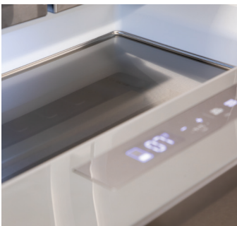
The stainless steel cooling plate enhances the cooling efficiency of the Flex Drawer.

The multipurpose Flex Drawer with independent temperature control adapts to your lifestyle. Optimize your storage of meats (30°F), or deli items (37°F). The stainless steel cooling plate helps achieve rapid and even refrigeration. Expecting guests? Set your Flex Drawer to the ideal temperature for beverages (34°F). You can even convert it to a wine chiller (41°F). Gliding smoothly, and extending fully, you always have easy access to what's inside. The spacious Freezer Drawer includes an upper pullout-drawer for quick access to grab-and-go items and an extra ice storage bin. With customizable storage and thoughtful engineering, the elegant stainless steel SJG2254FS refrigerator really is Simply Better Living.