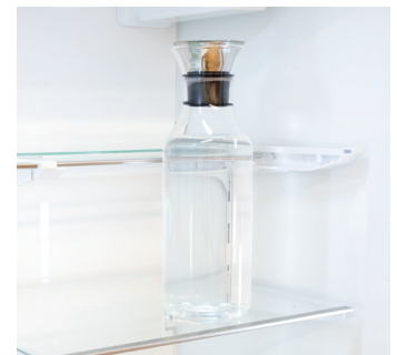
The adjustable Slide-In shelf gives you more space to store larger items such as pitchers and bottles.

SHARP ELECTRONICS CORPORATION 100 Paragon Drive, Montvale NJ, 07645 1.800.237.4277 • www.sharppusa.com