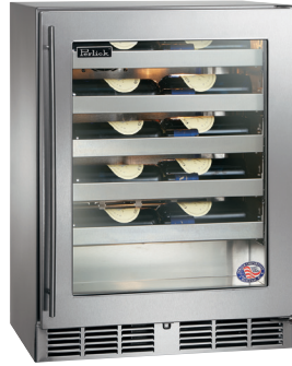
Glass Door Model