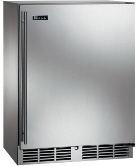
Solid Door Model

Perlick ® QUALITY & INNOVATION THAT INSPIRES