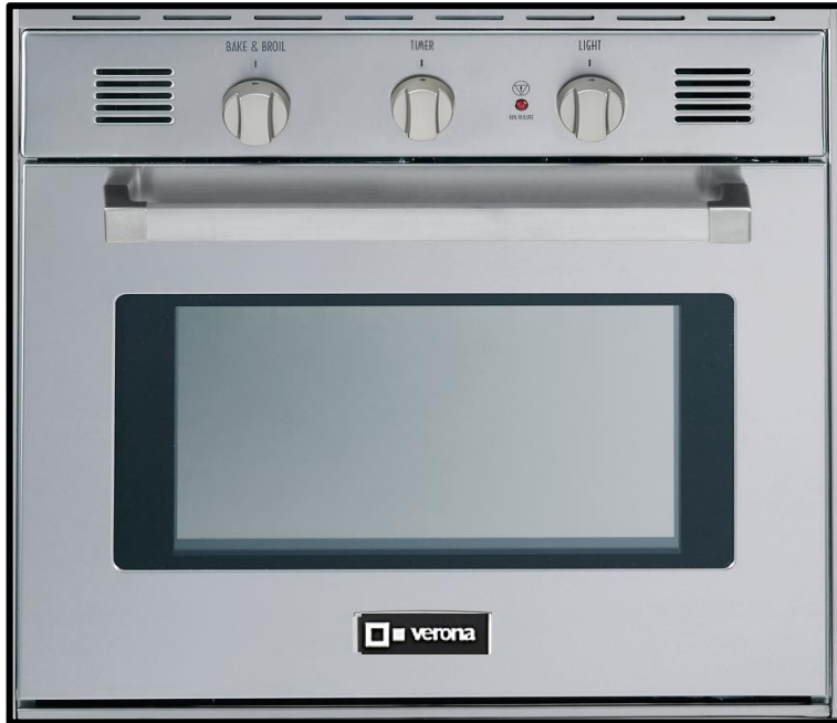
VEBIG24NSS - Stainless Steel